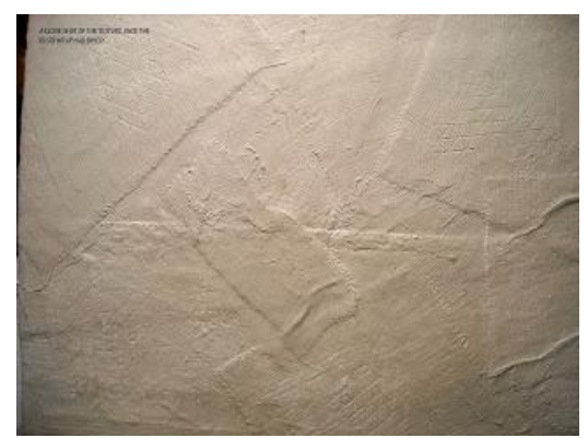
Dried - without color