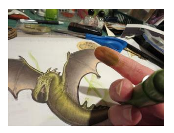
The images were glued down with gel medium and the coins, gears and tokens were attached with Tacky Glue.

The dragon was resized in my print program to a full page size and printed on heavy card stock. I applied Gelato pigment to my fingertip and then rubbed it on the image to avoid streaks. I also chose a background that had a dragon image on it and cut them both out.