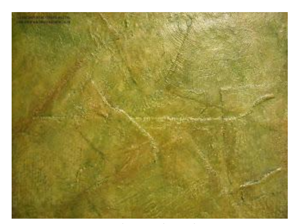
Dried - with color

The dragon was resized in my print program to a full page size and printed on heavy card stock. I applied Gelato pigment to my fingertip and then rubbed it on the image to avoid streaks. I also chose a background that had a dragon image on it and cut them both out.