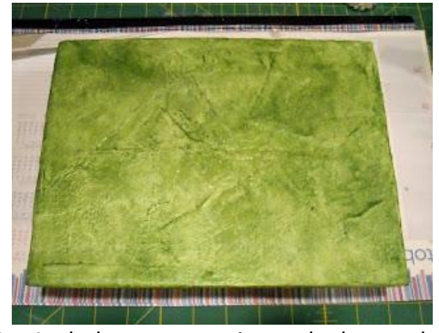
Art Anthology green paint as the base color

prevent the Gelatos from smearing or rubbing off. A touch of Irresistible spray was added for more texture.